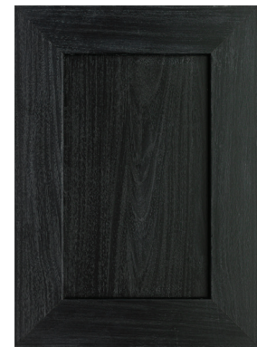
Onyx Picture Frame DuraCraft® Cabinets Kitchen Island Cabinets