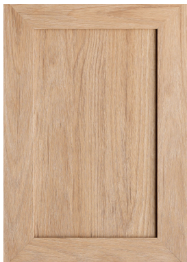
Bishop Oak Picture Frame DuraCraft® Cabinets Primary Kitchen and Bathroom Cabinets