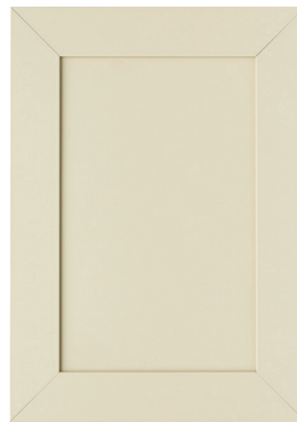
Studio Beige Picture Frame DuraCraft® Cabinets Primary Kitchen and Bathroom Cabinets