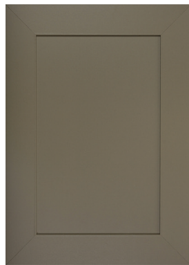
Plover Picture Frame DuraCraft® Cabinets Kitchen Island Cabinets